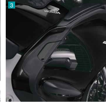
Pannier Scuff Pad Set Protect the front corners of your pannier lids from knocks and scratches with these black polyurethane pads. They can be painted to colour-match your bike.